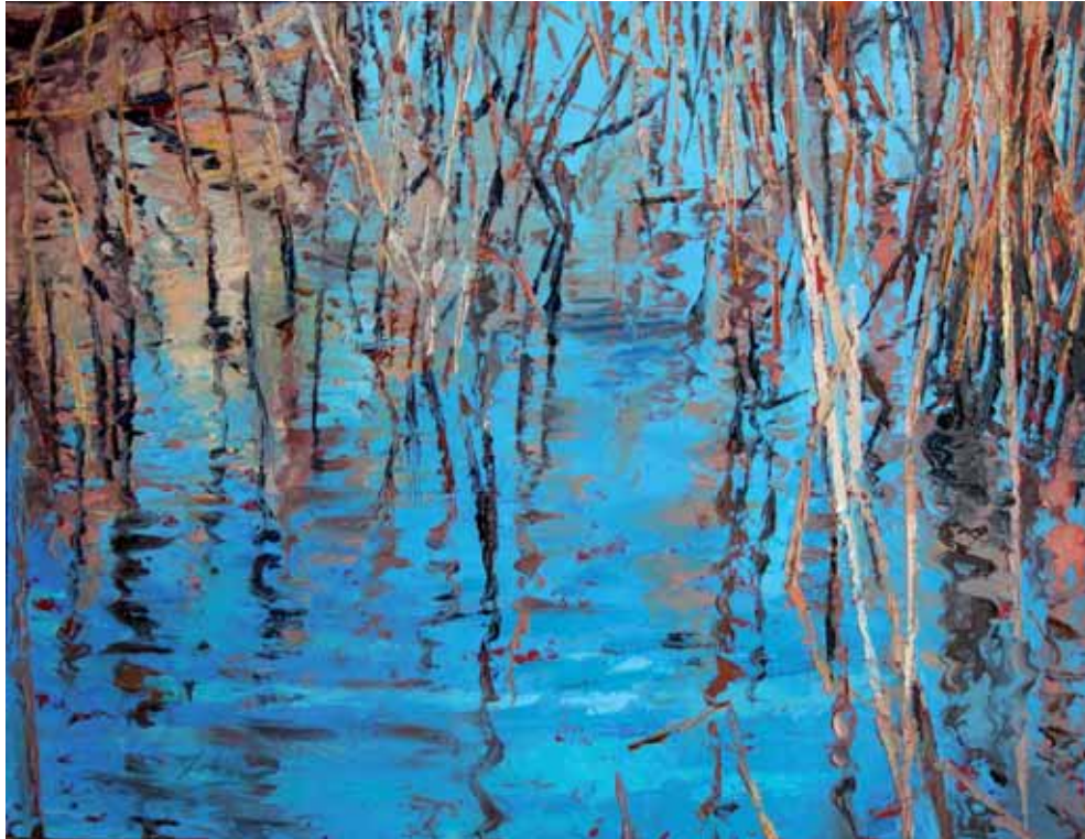
Bramble Flap, Norfolk , oils on panel 43x34cm