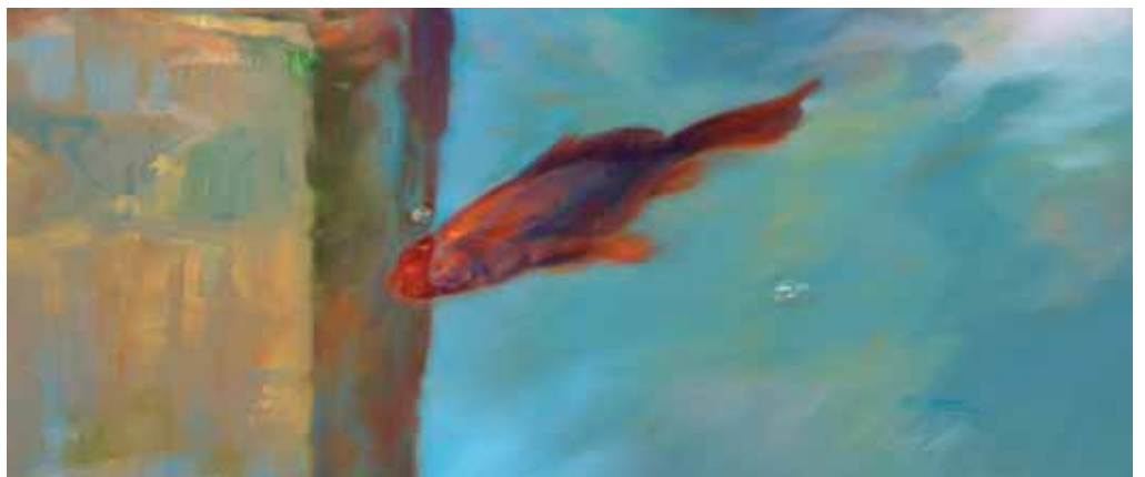
Clifftop Pool Reflections , oils on panel 61x30cm Red Earth , oils on panel 50x120cm Clifftop Pool , oils on panel 61x30cm