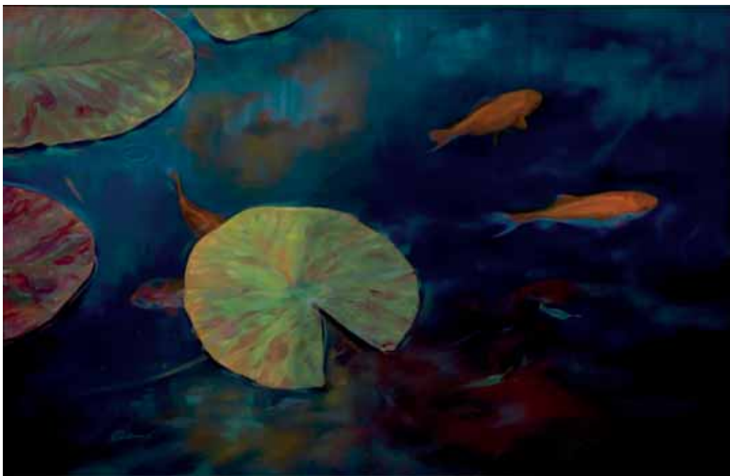
Deep Pool Lilies , oils on panel 76x76cm Light on Lilies , oils on panel 85x55cm