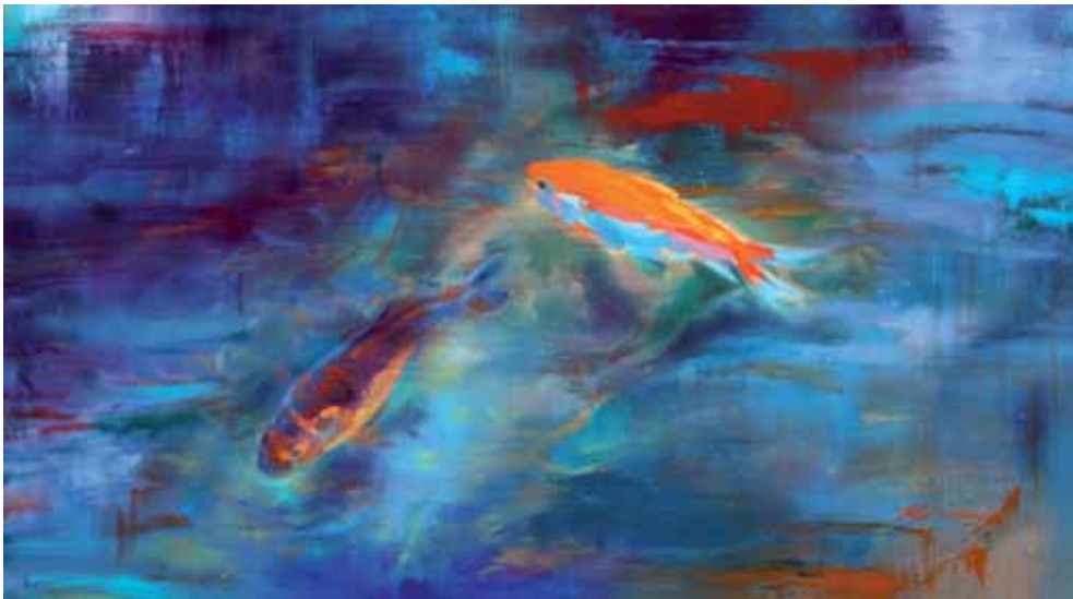
Red Sea I , oils on panel 60x60cm Secret Pool , oils on panel 30x45cm