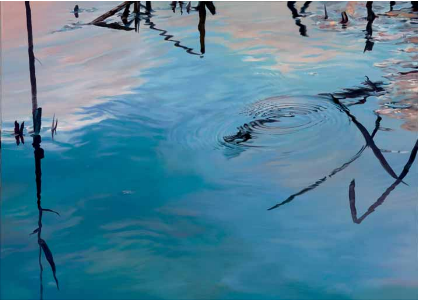
Black Reeds , oils on canvas 95x55cm