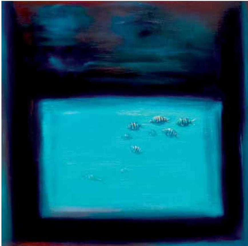
Ice Pool , oils on panel 50x50cm