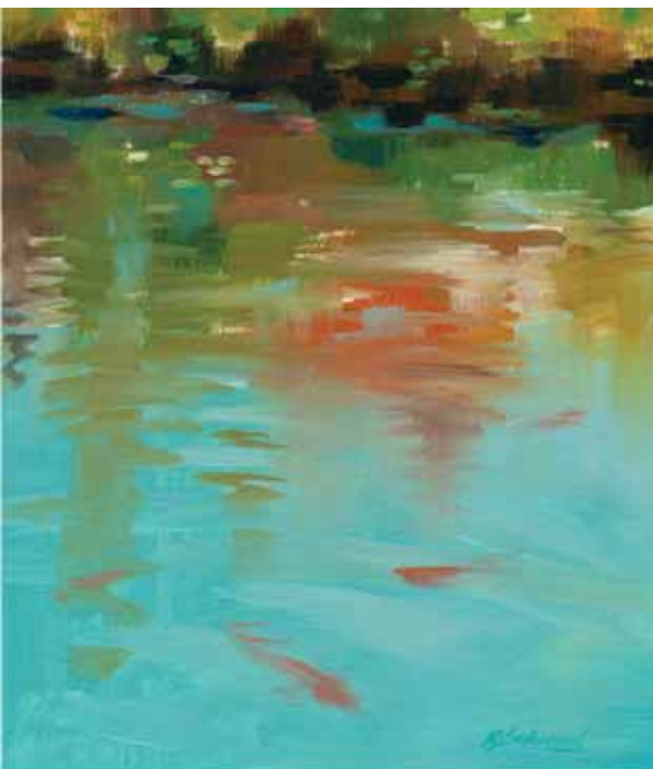
Cromer Pier, Wet Sand , oils on linen 23x21cm Wet Sand, Sheringham , oils on canvas paper 24x24cm Water's Edge , oils on canvas paper 17x21cm