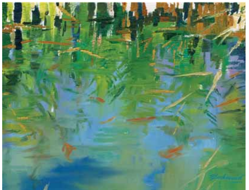
Willow and Lilies , oils on canvas paper 25x22cm Sheringham Lilies I , oils on canvas paper 22x22cm Water Garden I , oils on canvas paper 25x18cm