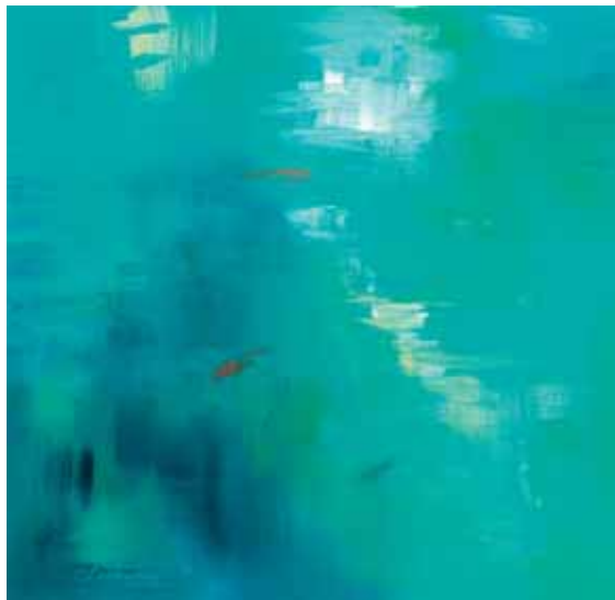
Silver Pool , oils on canvas 100x100cm Turquoise Pond I , oils on canvas paper 22x22.5cm