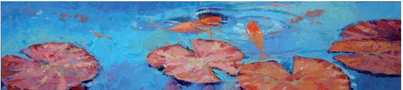
Hot Pool , oils on panel