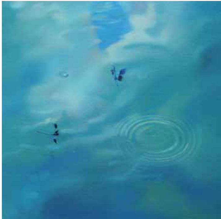
Lilies, Whittingham Lane, oils on linen 60x60cm Two Banded Demoiselles, oils on canvas 50x50cm