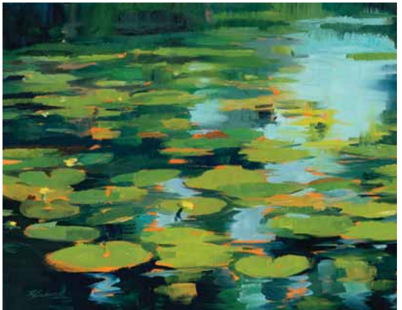
Shady Edge and Lilies , oils on canvas paper 24x19cm