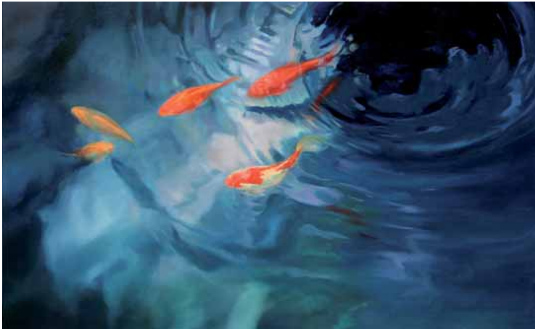
Sheringham Pool Reflections , oils on canvas 60x60cm Koi Pool Ripples , oils on canvas 76x120cm