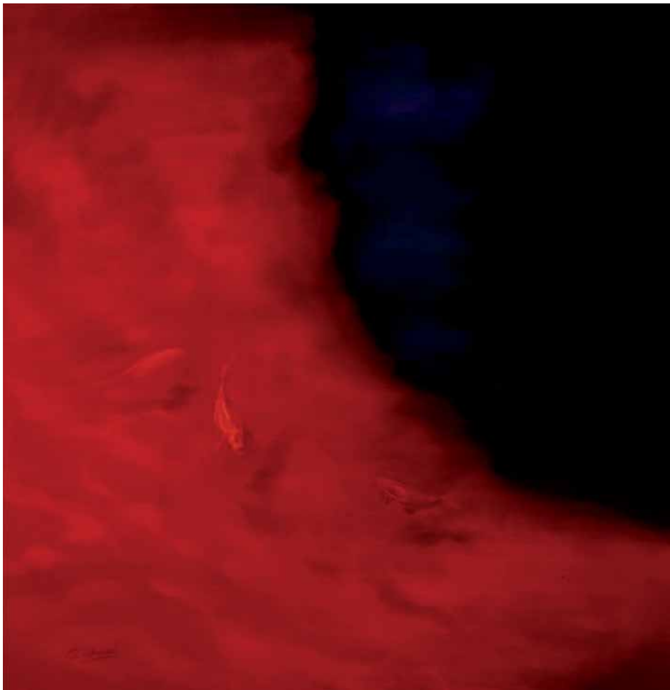
Deep Blue Edge , oils on panel 120x120cm