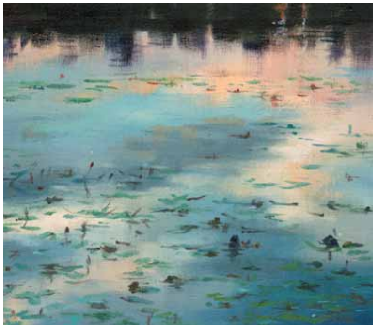
Sheringham Boating Lake , oils on paper 23x20cm Cley Reeds at Water's Edge , oils on linen 24x20cm Whittlingham Lane Lilies , oils on linen 25x24cm