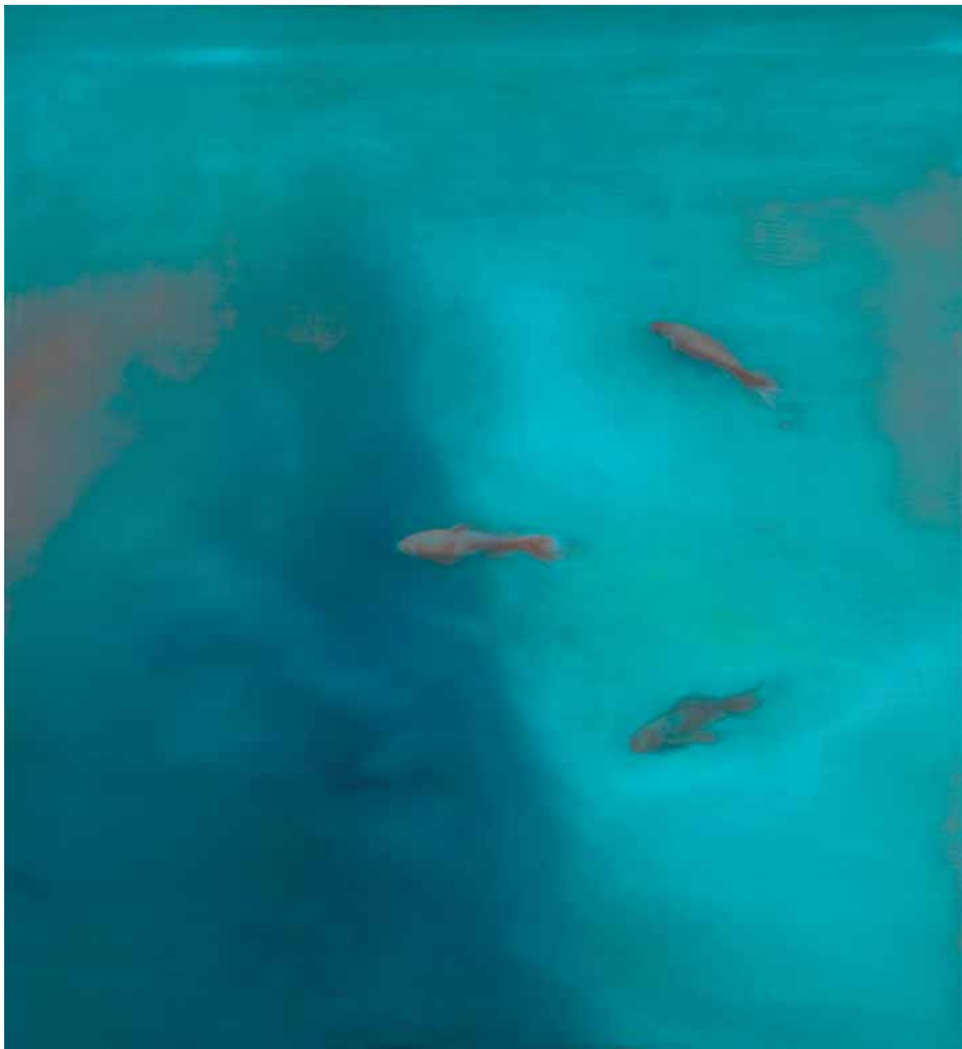
Turquoise Koi , oils on panel 120x120cm